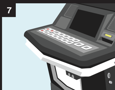
7 CLOSE ALL DOORS