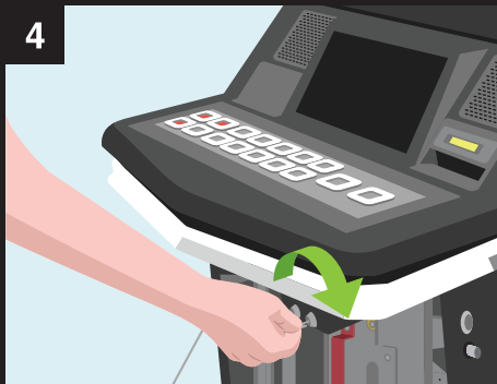
4 INSERT AND TURN AUDIT KEY