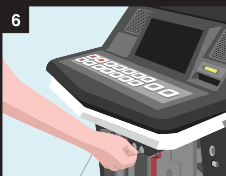
6 TURN AUDIT KEY AND REMOVE