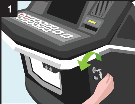
1 OPEN BOTTOM DOOR